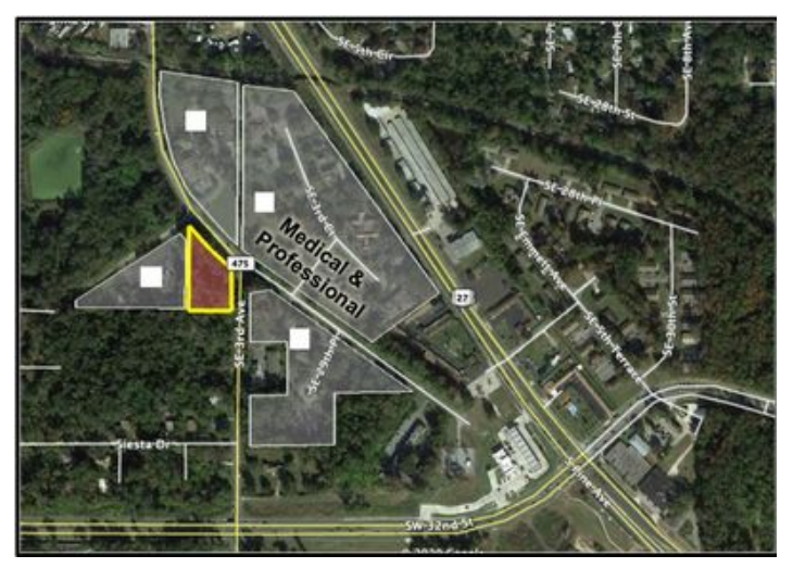
Location South Pine Medical and SE 32nd StJPG