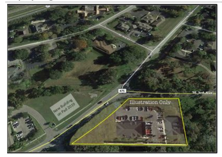
Concept for illustration