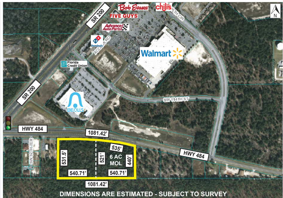
DIMENSIONS ARE ESTIMATED - SUBJECT TO SURVEY